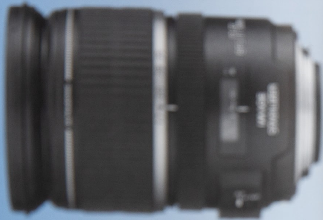
IMAGE STABILIZER ULTRASONIC

Warranty card text in multiple languages: English, German, French, Italian, Dutch, Spanish, Portuguese, Swedish, Finnish, and Greek.