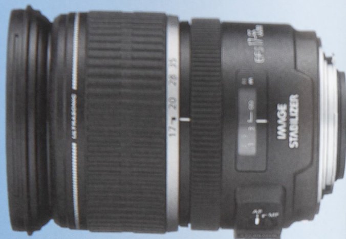
IMAGE STABILIZER U ULTRASONIC

Inst Mode Bedienung Instruc Ist Handl Bruksanv Brugsvejle Käyttö Инстру